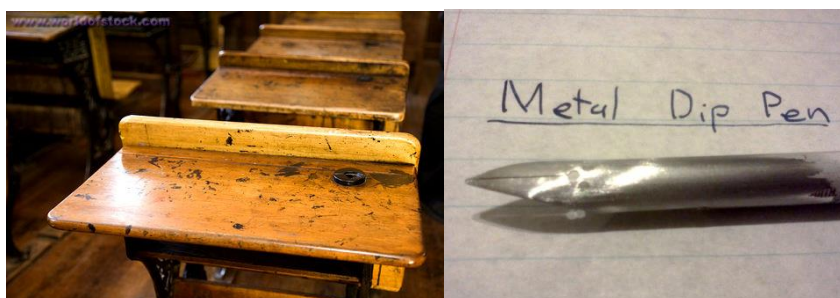
School desks as they were for hundreds of years (at left). Note the ink-wells on the right hand side. Steel dip pens of the type I used as a small boy school (at right). Thus 'blotting your copy book'

While I was writing this column, I had to apologise to a young colleague who was showing me how to use a simple computer programme, which I did not understand. So I explained that my training in writing is obsolete and is a barrier to learning now. When I was a small boy, in the period long ago before reliable ball-point pens, writing was done at school at desks with ink-wells, using steel-tipped dip pens (see above). The big worry was ink blots on our exercise books. This made me remember the inside of the middle finger of my right hand, permanently bruised and stained, and the class monitor who filled the ink-wells from vessels looking like miniature watering cans who spilled ink on your desk accidentally on purpose, and some of us using rulers to flick pellets of ink-soaked paper at the backs of necks of boys in front. The technology, and the bad behaviour of the boys in the back desks, were much the same as 300 years previously, except that then the instruments of writing were quills.