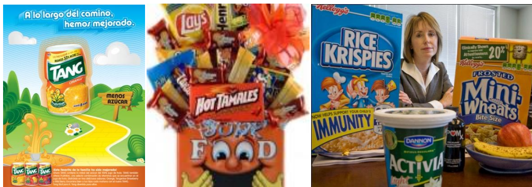
Soft drinks and ready-to-eat or snack foods that do make health claims (left) or have done so (right) or might do, given the addition of synthetic nutrients

Which if so, seems to open a very big door, to a way of seeing nutrition that is welcomed by alternative and orthomolecular practitioners, and which is the stuff of commercial life to the 'health food' trade, food technologists and the pharmaceutical industry, and now also transnational food and drink processors, but is usually rejected by the conventionally trained nutrition profession. The name of this enterprise is functional foods. Business in the US in products claiming some positive health function is annually close to 'double-digit' within a generally flat overall market, increasing from $US 28 billion in 2005 to $US 37 billion in 2009.