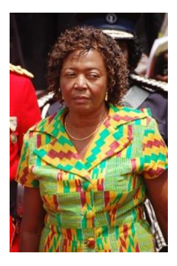
Annan R, Zero tolerance for death in childbirth, and other stories [Column]. World Nutrition, February 2012, 3, 2

The billboard says: 'Out of every 100,000 women who give birth, 350 die'. Let me tell you a little story. In the town I live in now, I have heard of two women dying during childbirth in one hospital. These women were mid to late twenties, freshly married, their first deliveries. and clearly affluent. They were not in a rural area. Their backgrounds tell me they are likely to be of good nutritional status and better ways of life. They might have taken all the precautions while pregnant because of better education and awareness. They probably attended all the antenatal clinics and were driven to the hospital in good private cars during labour. The hospital they died in is one of the best in the country. These deaths may have nothing to do with the health service delivered to them. These two examples could also be out many thousands successful births. I do not have the full story yet but one thing is clear. Maternal mortality is a significant problem, not confined to rural areas of Ghana. I hope deaths of this nature are properly reviewed, questioned and health professionals are held accountable if any negligence is reported.