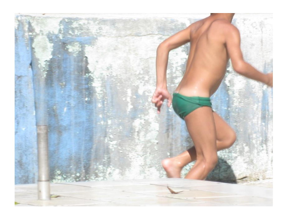
Fun at Barrakin. Its owners have built a small swimming pool that everyone including children of the families who live in the forest can use and enjoy

Barrakin also reminds me again that there's more to food and health than prevention of disease, important though this is. In my last column I wondered whether our topic should not be called 'nutrition' (which refers mostly to the body) but instead 'nourishment' (which refers also to the mind, heart and spirit) (3). The locally-sourced, prepared and cooked food and drink at Barrakin is so-so to no-no from the nutritional point of view, but it is wonderfully nourishing.