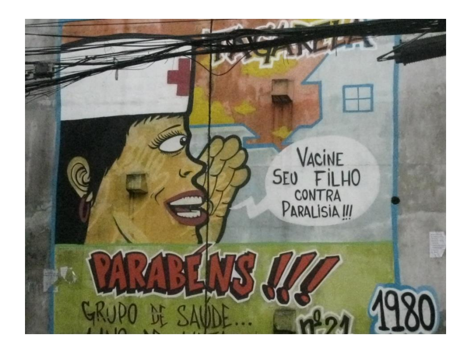
Rocinha public health messages. This one urges parents to have children vaccinated against infantile paralysis. 'Parabéns!' means 'congratulations!'