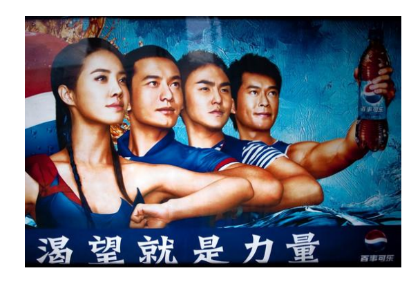
A travesty of images of Chinese revolutionary youthful fit and slim vision and fervour, here being used to advertise a super-sized sugared fizzy drink

These are not snaps. Many $US 000s are spent on the studio shots, and many $US 000,000s are spent on getting the stars, their teams, and their controllers, to wear the gear and thus be living advertisements for what is, apart from colours and flavours and gas, sugared water. Advertisements for Pepsi-Cola in the global North are softer and more subtle. Out in India, transnational corporate publicity – not just PepsiCo, of course – is 'red in tooth and claw'. Savage and ruthless.