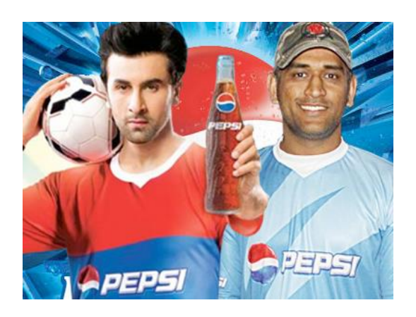
Indian sporting stars MS Dhoni and Ranbit Kapoor persuading the youth of India that it's cool to drink Pepsi-Cola and suggesting that they drink it too

Armed with this unoriginal insight, I googled 'pepsico' this, that and the other, together with 'pictures' and here is one of the first images I found. It shows how PepsiCola is being marketed in the global South, in order to approach and exceed the 'double-digit' growth of 10 per cent or more extra sales every year. Here is Exhibit #1: an advertisement for Pepsi-Cola in India: