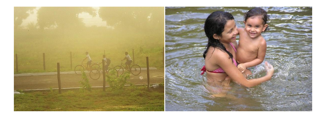
Brazilian backlands. Illustrations of fundamental nutrition, which includes basic education, and elemental nutrition, which includes clean safe water

Which is to say, properly understood, nutrition fundamentally is a social, economic and environmental as well as a biological and behavioural science. Even deeper, it is an elemental science. To raise up deprived, exploited and ravaged populations, we need to think about earth (land) and also fire (energy), air and water. Or, to state this in another way: in the full sense of the word, nutrition is political.