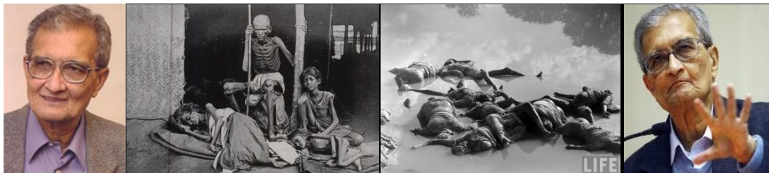
Amartya Sen in sage mode (left) and in active mood (right). In the centre are pictures of what he saw in his country as a boy and remembers; the 1943 Bengal famine, the 1947 Punjab partition holocaust

From Amartya Sen's commentary: One of the oddities in the contemporary world is our astonishing failure to make adequate use of policy lessons that can be drawn from the diversity of experiences that the heterogeneous world already provides. There is much evidence of the big contributions that universal health care can make in advancing the lives of people, and also in enhancing economic and social opportunities... We have every reason to base public policy on proper understanding of the nature and reach of what is clearly a positive interdependence. There is no mystery in all this, given the centrality of health for better lives and for enhancing human capabilities.