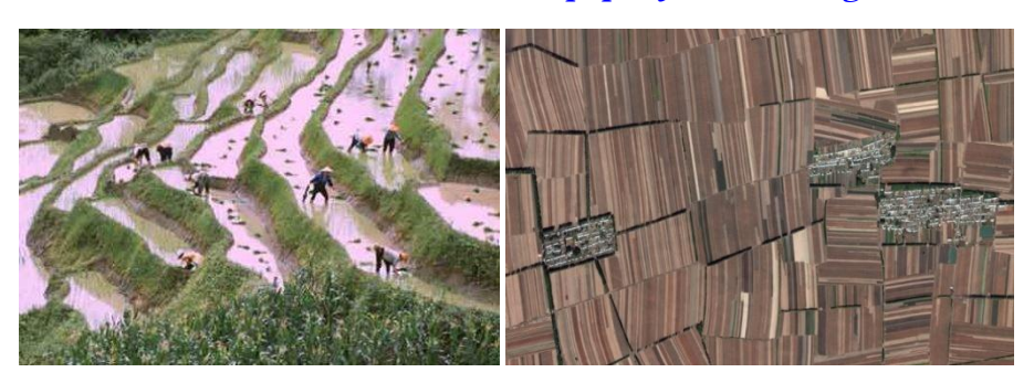
Traditional Chinese farming (left) preserves the environment and is of food made by people into meals by the community. Industrial Chinese agriculture (right) destroys ecosystems and is of commodities made by machines for human, animal and other consumption; much of it is exported