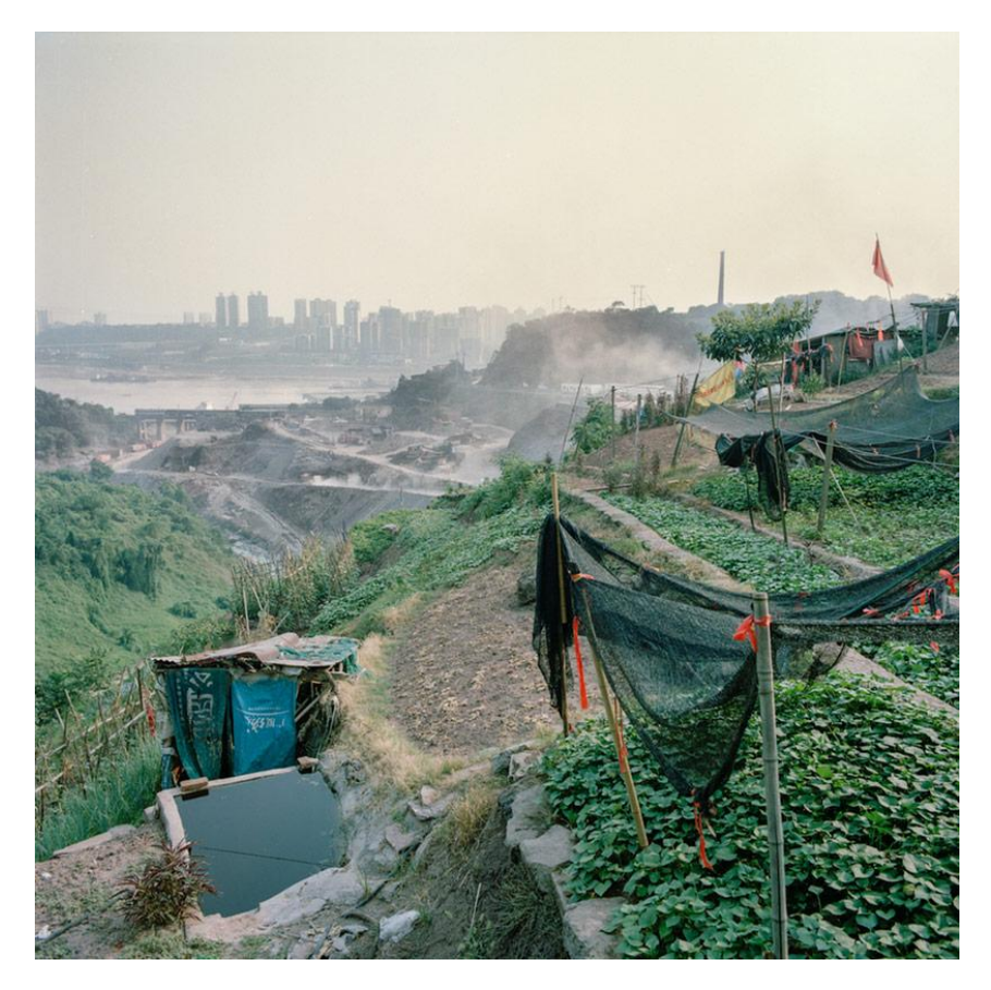
Land unsuitable for or claimed from building in the new cities is being converted into allotments and smallholdings whose soil is protected from erosion by age-old methods of terracing and constant care

In the late 20th century Shanghai produced nearly all its chicken, eggs and milk, most of its freshwater fish and vegetables, and half of its pork, in a 300,000 hectare green ring round the city, managed by the municipality – in effect, a vast urban farming complex.