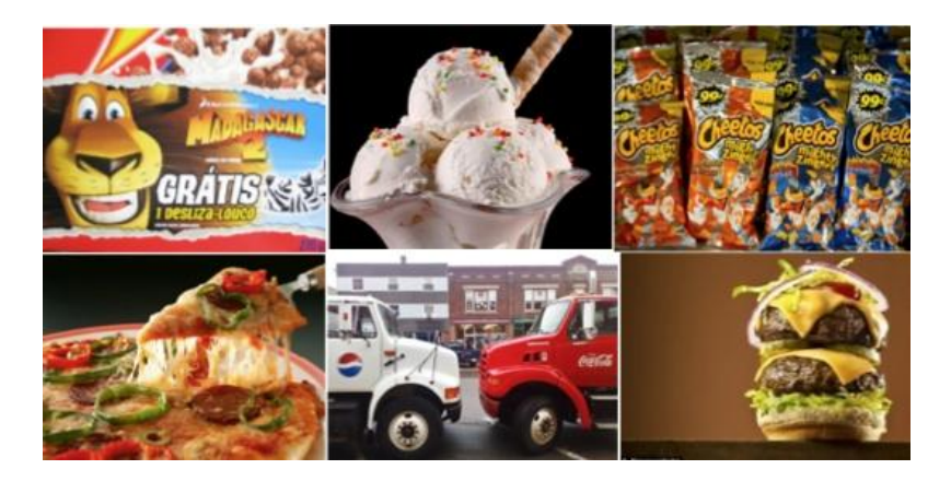
Here are some of the energy-dense fatty, sugary or salty ultra-processed products of the transnational Big Food and Big Soda corporations, which distort the WHO global strategy on diet and health

The commercial 'non-state actors' that most WHO officials like to do business with, are the generic trade organisations: corporate tools such as the International Food and Beverage Alliance. IFBA was set up in 2008 to ensure unified policy positions, so as to shape UN and national food policy strategies, and to ensure that ultra-processed product marketing remains under corporate control. Voluntary guidelines have been specified and controlled by IBFA members by means of made-to-measure 'public-private partnerships' which rationalise discussion on voluntary reformulation of some of their products, in ways liable to generate health claims that enhance their bottom lines and share prices. While competitive for 'market share' of the same types of product such as soft drinks, burgers, biscuits, and sugared breakfast cereals, all Big Food corporations share an identical global governing strategy. This is to displace food supplies based on foods and meals with ready-to-consume branded snacks, now especially in the global South. They run as a pack. Threatened, they attack as a pack.