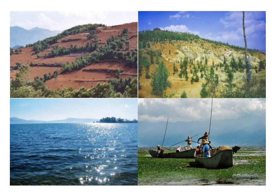
Landscapes in Yunnan. (Above) stable, cultivated terraced slopes contrast with hadly gullied slopes, (Below). The clear waters of lake Erhai before 2001 contrast with more recent algal contamination

In some localities, slow deterioration has now become a vortex – a rapid downward spiral. Some aquatic ecosystems have dropped over tipping points into new states where clear lakes suddenly become dominated by green algae with losses of high-value fish. These states frustrate continued high-level production of crops and fish, and they are very difficult and expensive to restore. Natural processes are degraded and destabilised to the point that they cannot be depended upon to support intensive agriculture in the near future. The whole region is losing its ability to withstand the impact of extreme events, from typhoons to global commodity prices.