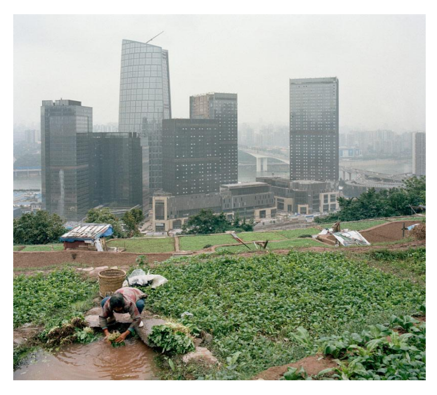
Agriculture is coming to the new and rapidly expanding cities of China. Communities that are leaving rural areas are finding work and growing food within the cities, using traditional methods